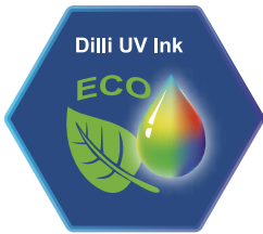
Dilli UV ink for high-end NEO EARTH Series

Speical Feature : Hybrid Printing System : Flexible and Rigid media printing | UV LED Curing System (Various of heat - sensitive materials available) | Print head Collision Prevention System | DAWC(Ink circulation system for whitehead protection) | Multi Layer Printing Mode (C+W , C+W+C , C+C+W+C etc./Max 5 layer printing available) | Enhancement of Space Utilization (Compact size with Built-in Extension Table)