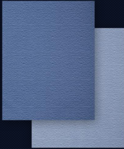
SAMPLE A Penetration without SPC