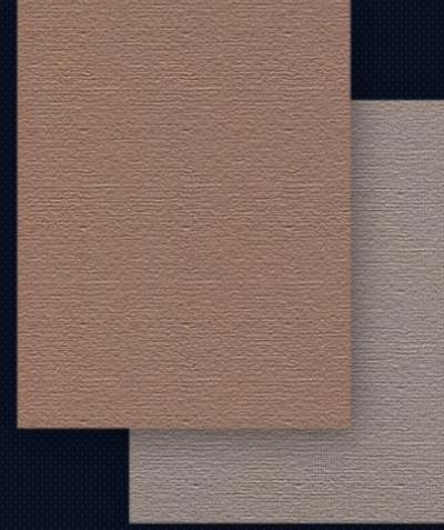
SAMPLE A Penetration without SPC