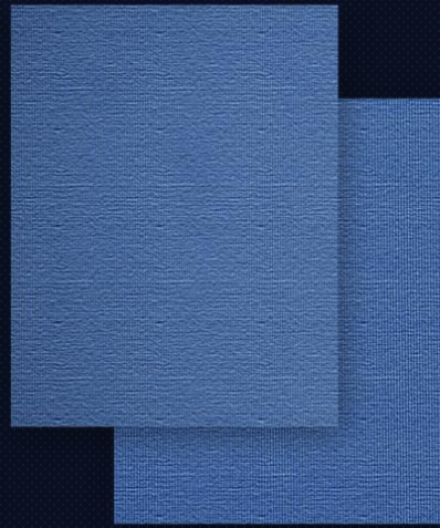
SAMPLE B Penetration with SPC