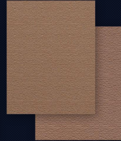
SAMPLE B Penetration with SPC